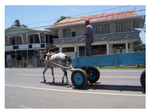
Local Guyanese transportation