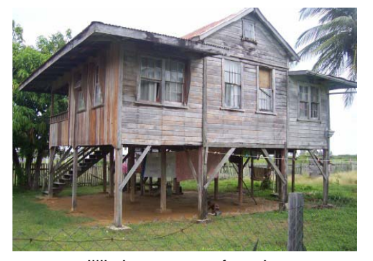
Jill's home away from home