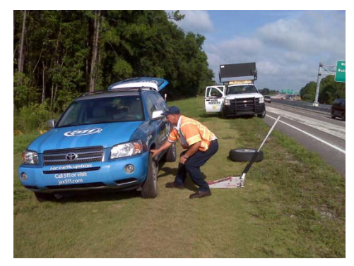
On the first day back on duty, Road Ranger Jeff Salyer comes to the rescue of the Probe Vehicle and Sherri on JTB