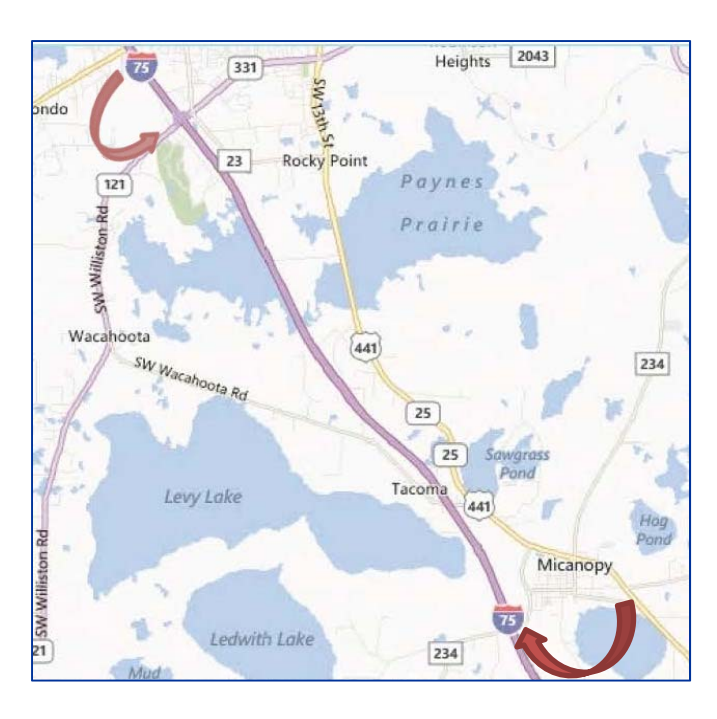
I-75 ITS Project Boundaries

Last but not least, an update to the I-75 ITS Project in Gainesville. The Engineer of Record has submitted 60% design plans for the installation of ITS devices and fiber optic cable from County Road 234 in Micanopy, going north to SR 121 (Williston Road). This project is anticipated to be completed in 2014.