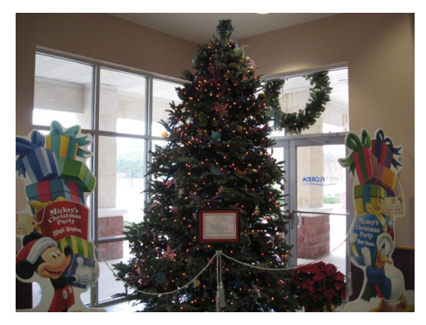
It is always a pleasure to visit our Friends/Partners at the I-95 Welcome Center

Over the course of the past year we've talked to 8,935 people at 27 events, and sent emails to 4,831. And we even had time to squeeze in one more visit to the I-95 Florida Welcome Center where we talked to another 105 motorists before the calendar year came to a close. What an incredible year this has been! We look forward to all that 2013 has to offer.