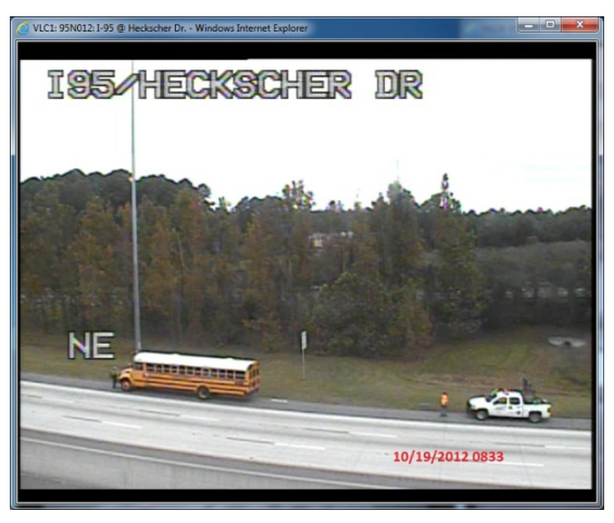
Road Ranger 204, helping to keep our school children safe.