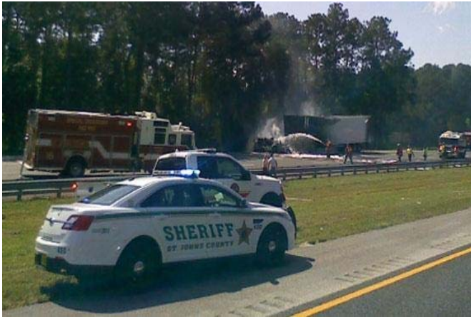
Accident of 4/23/15