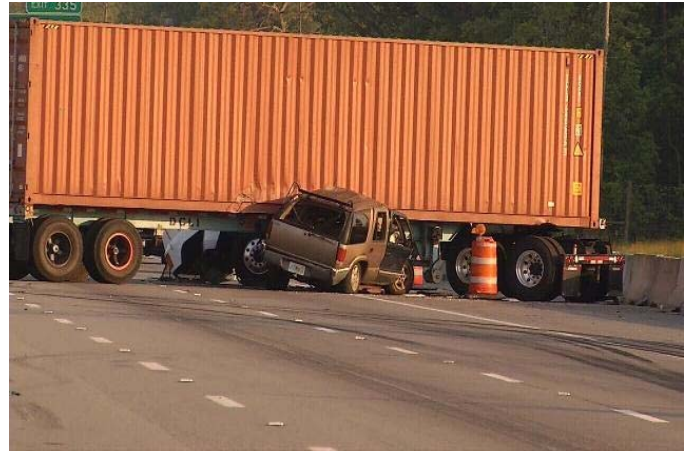
Accident of 5/11/15