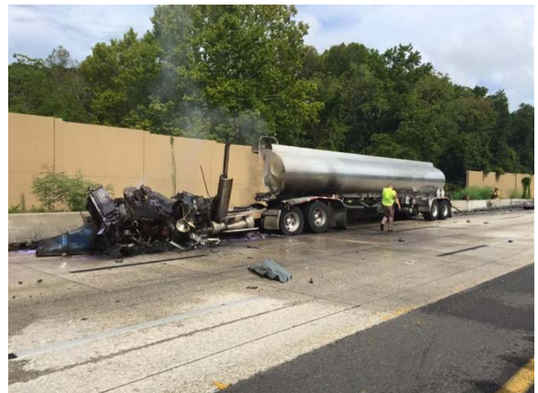
I-95 Northbound and Emerson in Duval County